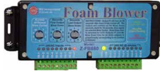
BLOW DOWN TIMER