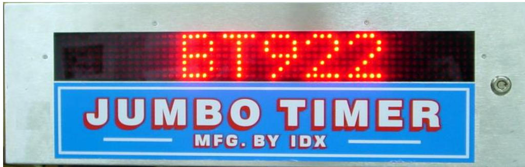
**GT922** JUMBO MULTI TIME TIMER