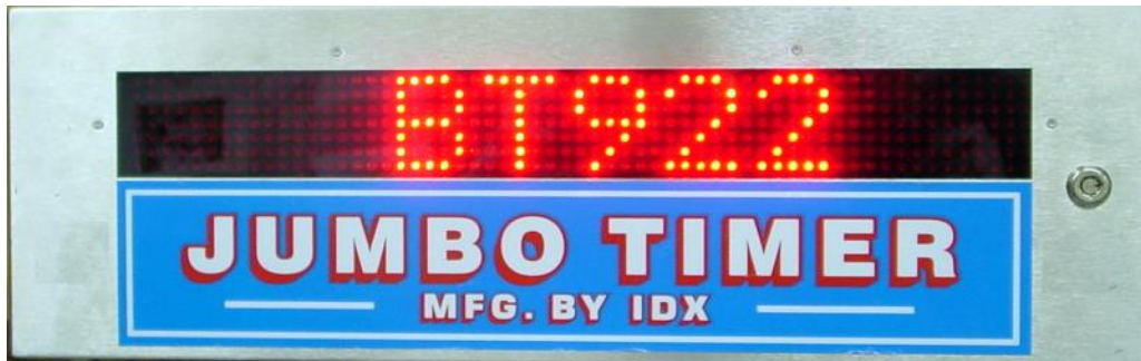
**GT922** JUMBO MULTI TIME TIMER